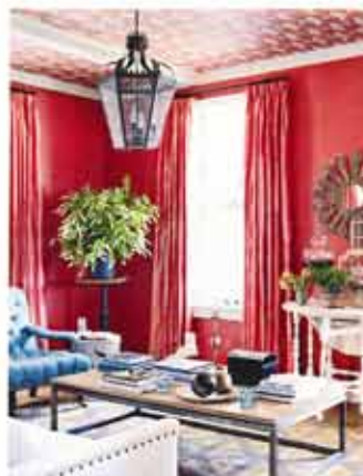
table), $760; horchow.com. Projector stand (used as plant stand), $275; kabinettandkammer.com. Sconces, $609 each; circalighting.com. Pendant lights, $249 each; wisteria.com. On table: Shiraleah votive holders, $18 for two; shopinspiredliving.com.

PAGE 101 LIVING AND DINING AREAS Curtains, $35 per yard; wolfhome-ny.com. Curtain rods and hardware, from $40; antiquedraperyrod.com. White garden stool (used as side