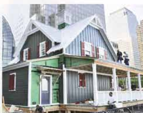
MAY 19–25 Workers completed the final details, including porches, siding, and shutters. Ridder then decorated the interior.