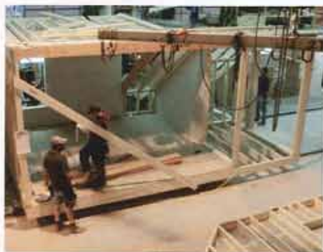
APRIL 27–MAY 16 Building the modules in a factory allowed for a multistep thermal sealing process—i.e., better insulation.

The very fact that this cottage's components originated in a College Point, Pennsylvania, factory makes the house more green: Construction in a controlled indoor setting generates only 2 percent material waste, versus the usual 30 to 40 percent for homes erected on-site.