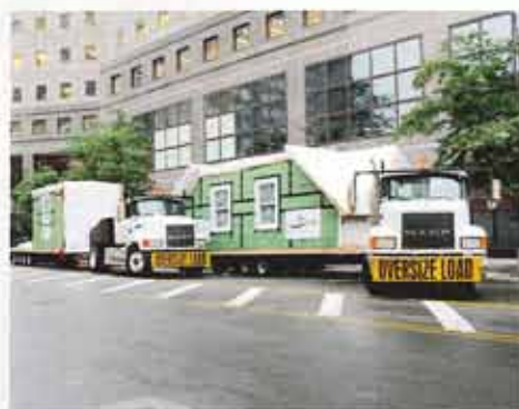
MAY 17 The components traveled from Pennsylvania to Manhattan's World Financial Center on several flatbed trailers.