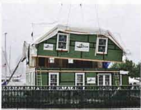
MAY 18 A crane aligned the individual units, which were sealed against the elements by the end of the day.